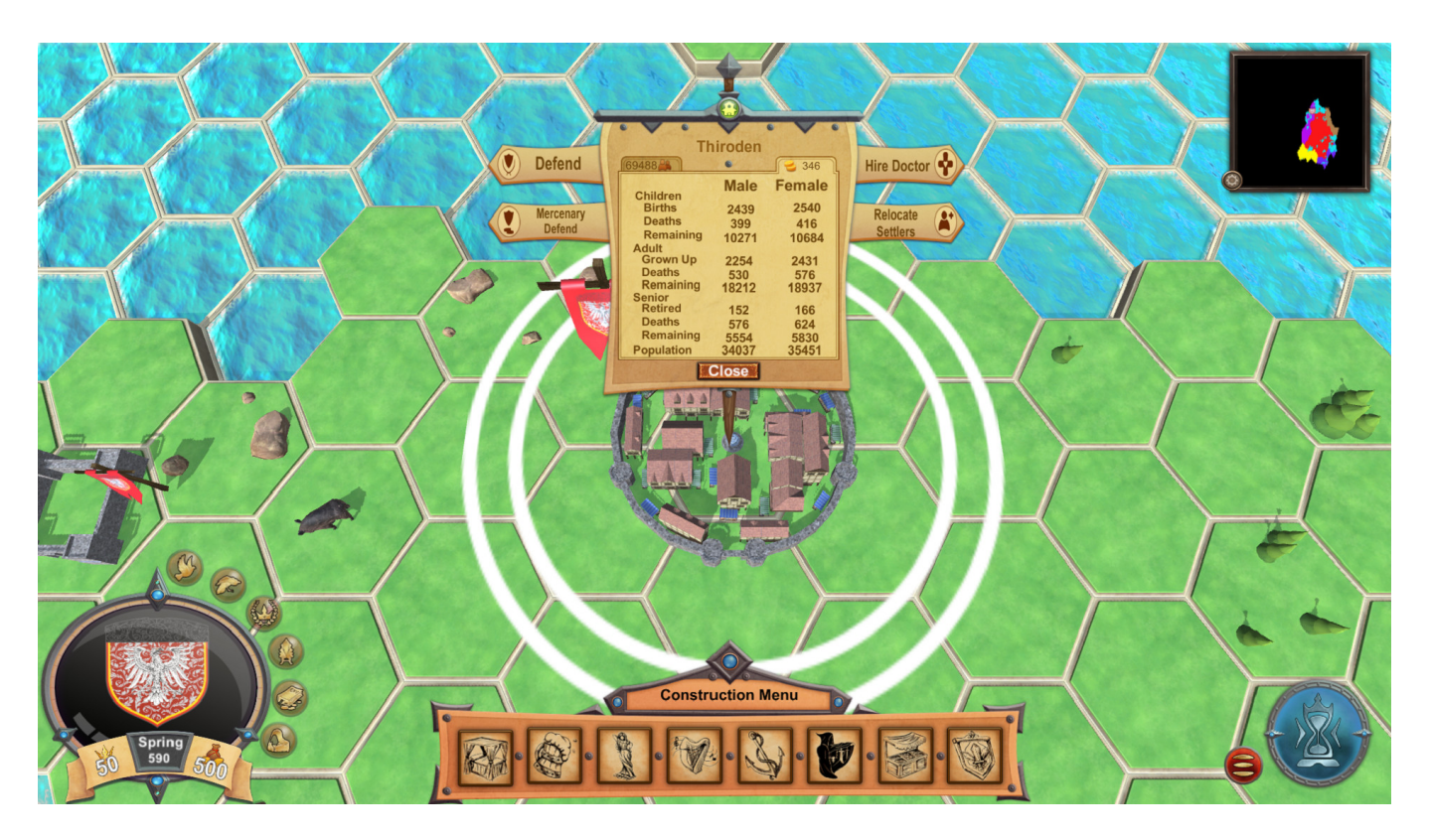
Tales Of A Spymaster Download Licence Key

Download ->->-> <a href="http://bit.ly/2QMIEYA">http://bit.ly/2QMIEYA</a>